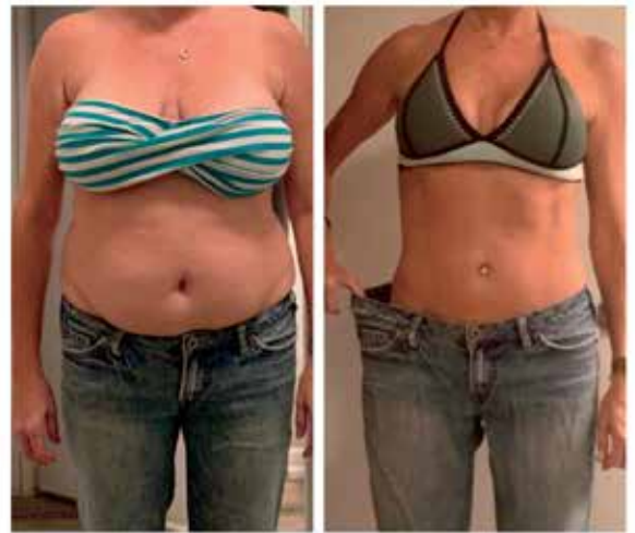
ACTUAL PATIENT RESULTS | SEMAGLUTIDE WEIGHT LOSS

9210 4th St. N., St. Petersburg, FL 33702